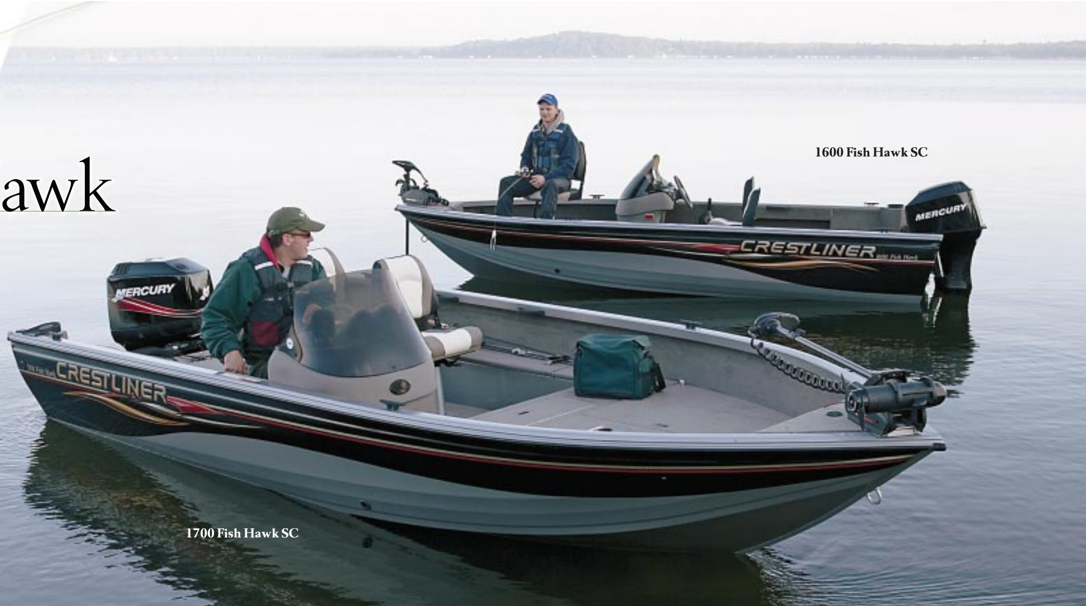
1700 Fish Hawk SC