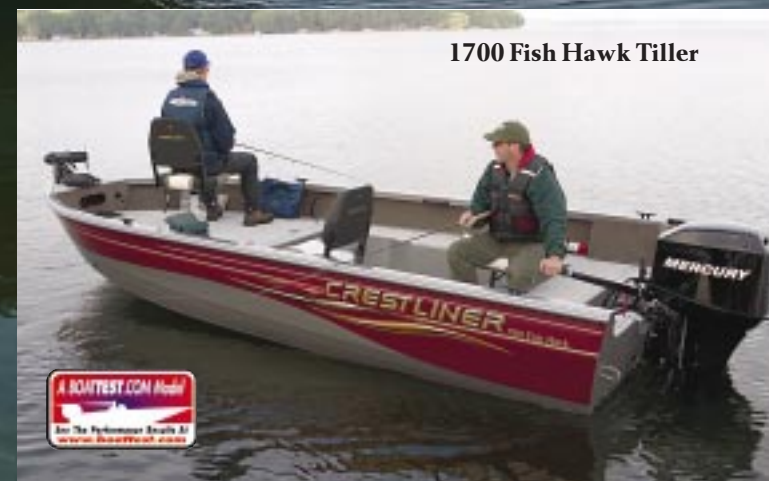
1700 Fish Hawk Tiller